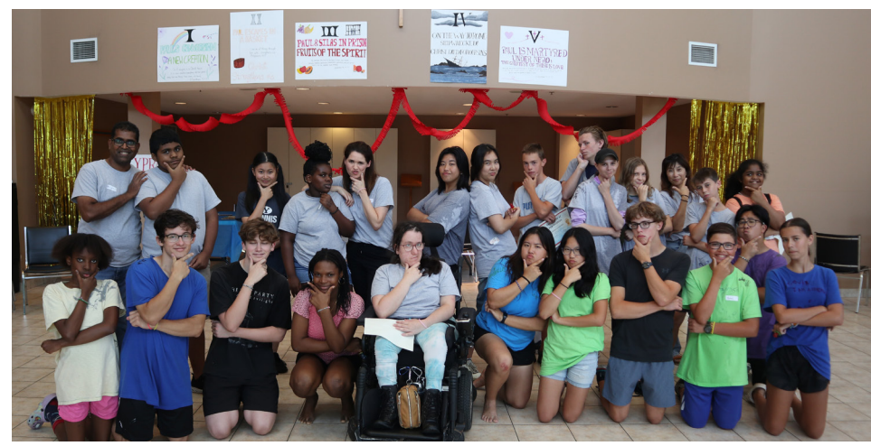
VACATION BIBLE SCHOOL VOLUNTEERS

Commemorate our parish's 60th anniversary with the purchase of three beautiful items: - Black baseball cap on sale for $25 - White stainless steel water bottle on sale for $20 - Silver stainless steel insulated travel mug on sale for $15. Taxes are included! You can pre-order your items after Masses on September 21st and 22nd. We will accept payments via cash and cheque at this time. You may order online using the QR code.