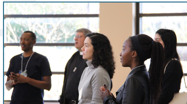
Welcome to St. Maurice

In the spirit of personal connections, we hosted our second New Parishioner Social in November. This event aimed to extend a warm welcome and foster connections. We are happy to host 45 new families who have recently joined St. Maurice. Praise God! 'Welcome one another, then, as Christ welcomed you, for the glory of God' (Romans 15:7)