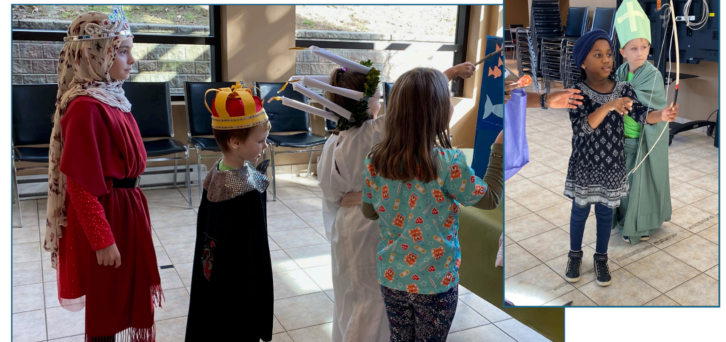
Family Ministry All Saints Party