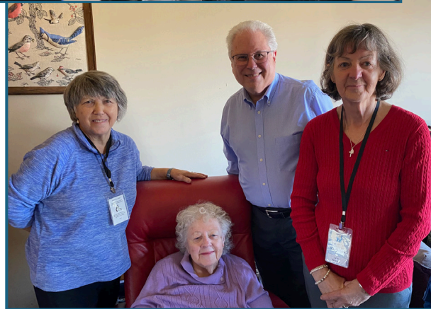
City View Retirement Residence